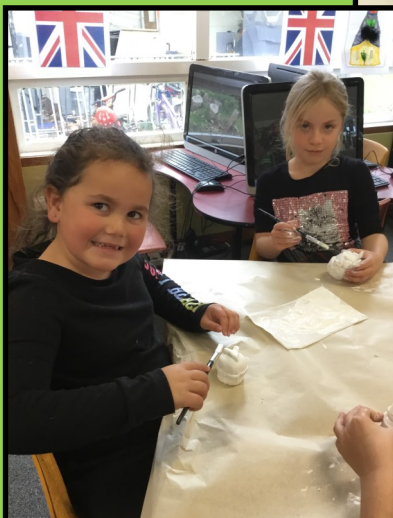
Room 2 Decorating their clay cup cakes