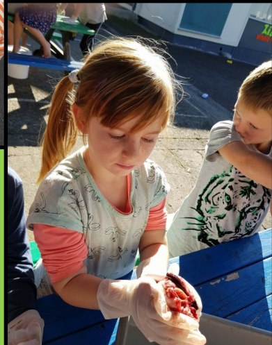
Checking out sheep body parts in Room 1